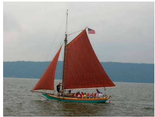
The Woody Guthrie under sail at the Great Hudson River Revival, our captains and crews took out nearly one hundred guests over the two days